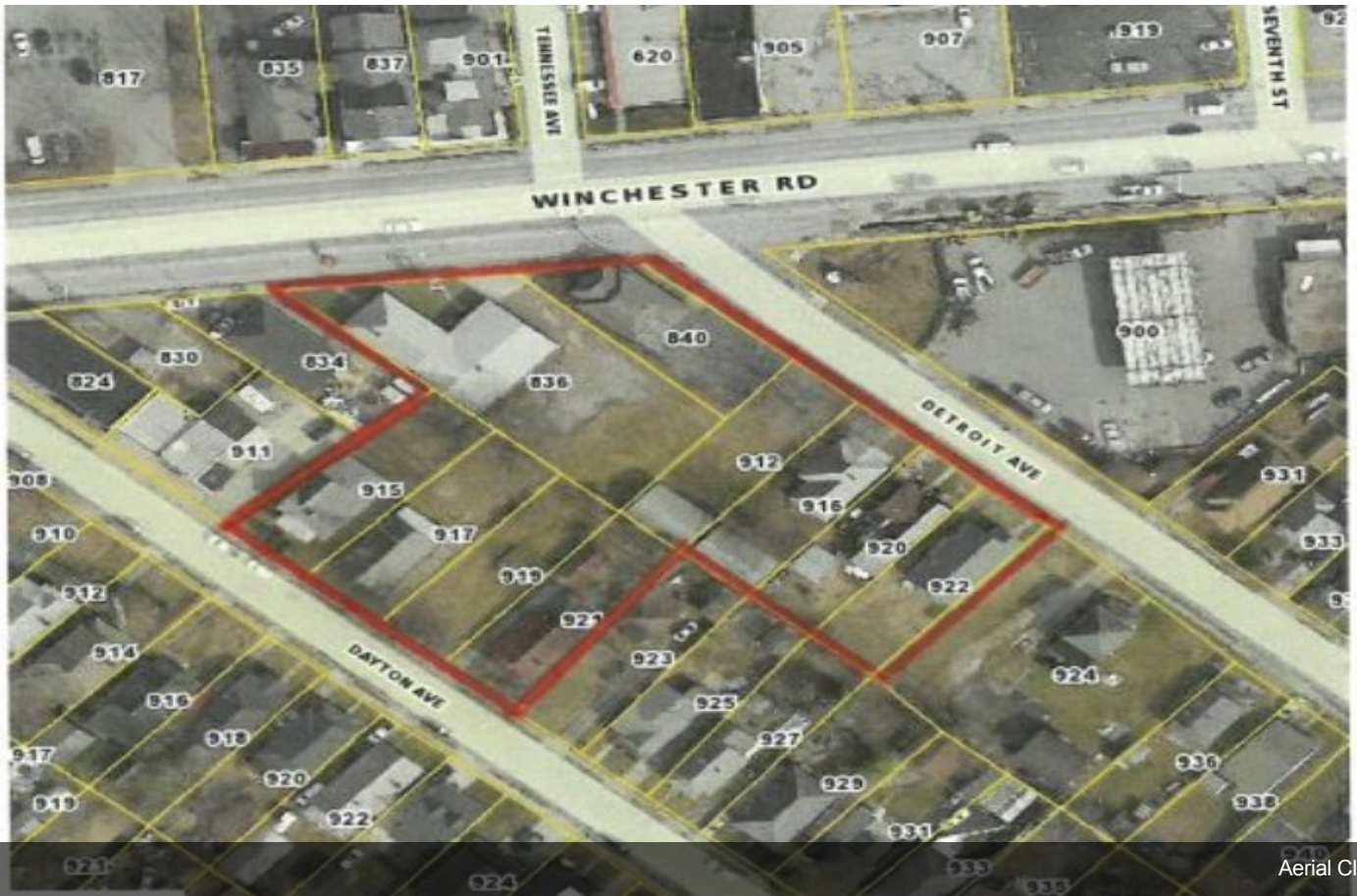
Aerial Close Up