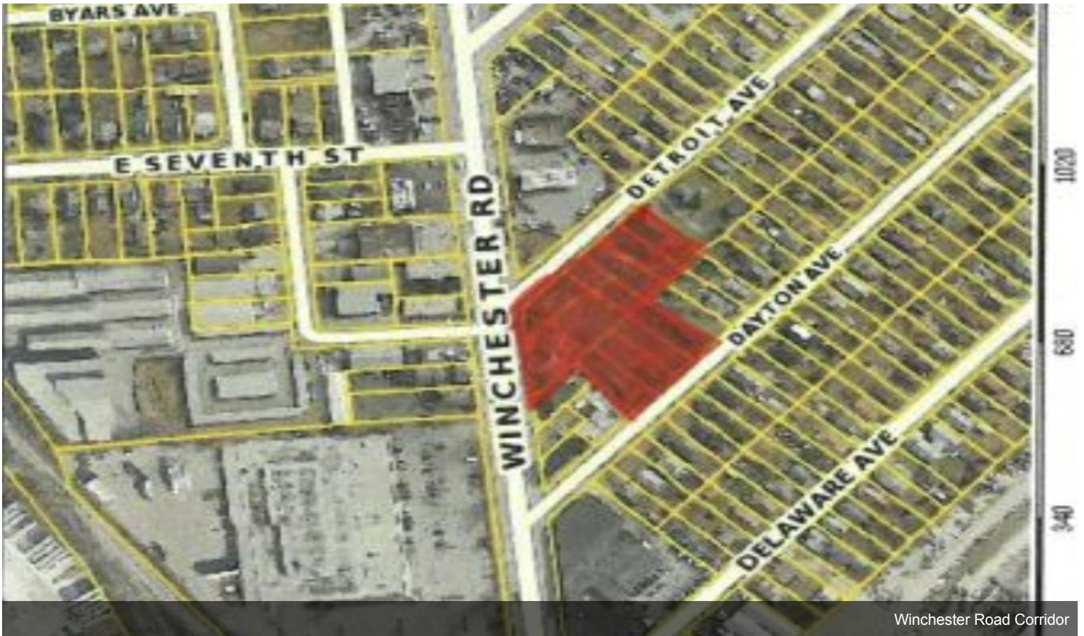
Winchester Road Corridor