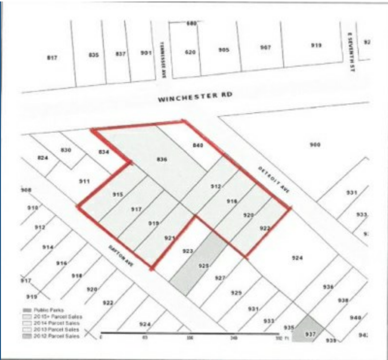
Address and Parcels

For more information visit: http://www.crelisting.net/RV-7zbR9Q/?StepID=107